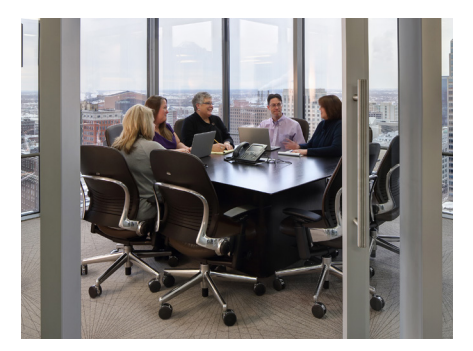
Promoting cognitive and emotional wellbeing, there is ample access to daylight and inspiring views of the city.