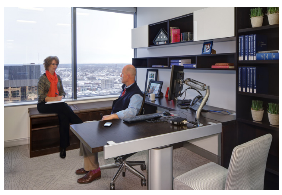
Senior and junior partners all have offices the same size, furnished with high-performance Leap seating and Elective Elements freestanding office system.